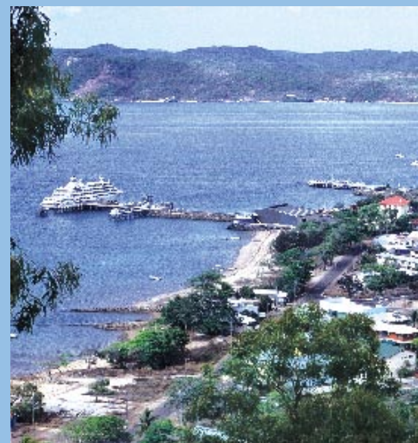
Exploring in style ... The MV Reef Endeavour , opposite page, Lizard Island, passengers celebrate reaching The Tip and Thursday Island.